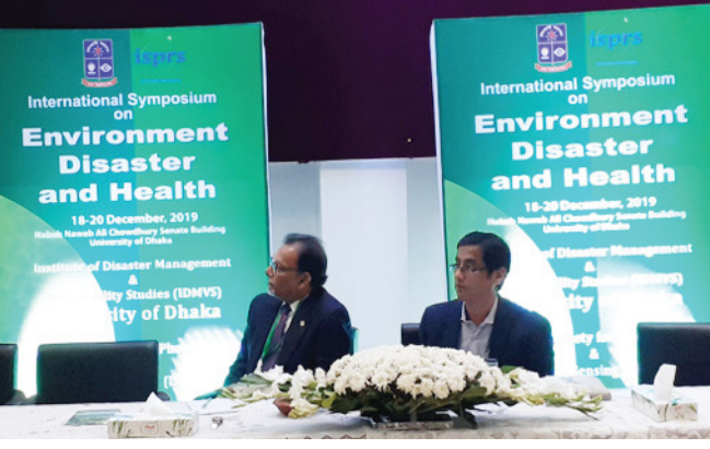
University of Dhaka, Bangladesh