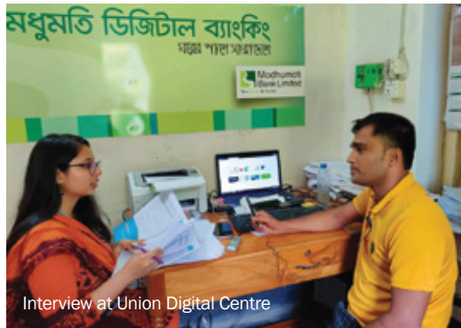
Interview at Union Digital Centre