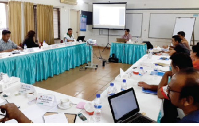
CCDB HOPE Foundation, Baroipara, Savar, Dhaka