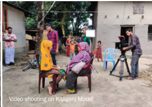
Video shooting on Kaliganj Model